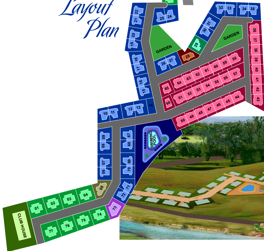
Phase - II